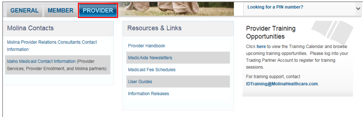
Figure 2-4: Home Page - Provider Tab

The Provider tab on the home page contains contact information and resources for Idaho Medicaid providers.