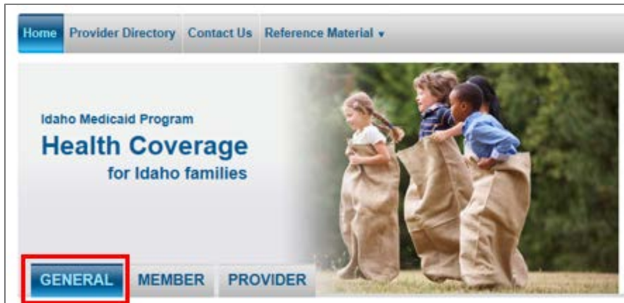
Figure 2-2: Home Page - General Tab

The General tab on the home page contains quick access to information frequently used by providers (see Figure 2-1).