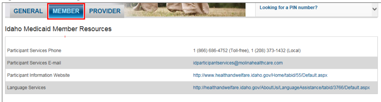
Figure 2-3: Home Page - Member Tab

The Member tab on the home page contains contact information and resources for Idaho Medicaid participants.